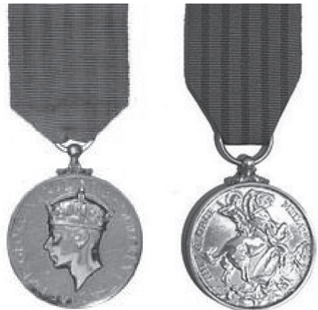
Obverse (left) and reverse (right) of the medal.