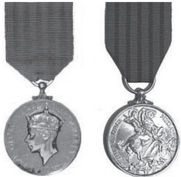
Obverse (left) and reverse (right) of the medal.