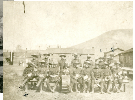
NWMP Police Band, Dawson 1902