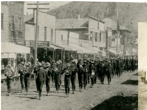
Police Band leading parade through the streets of Dawson, 24 May 1902

From that day to this a strong musical tradition has wafted its way through the history of the Force. A tradition that has also left its mark on the RCMP Historical Collections Unit. Perhaps nowhere more so than among the archive collections which, for the last 12 months, have been the focus of a special project to scan and digitize them. With the