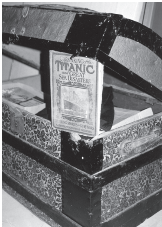
The original antique trunk and book TITANIC!