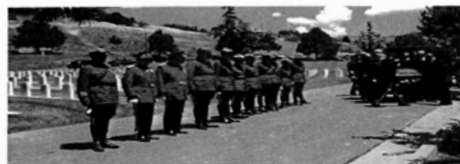
Members of E Division attend artist Arnold Friberg's funeral in Salt Lake City, Utah.