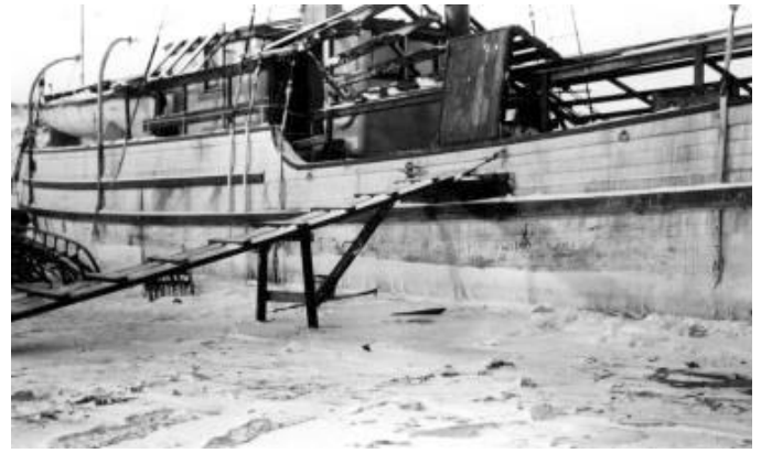
A protective covering was built over St Roch when overwintering. Here shown at Tree River in 1930's. 7

members from one post to another. They acted as coroners, justices of the peace and occasionally investigated murders or transported prisoners. They explored and mapped large and remote Arctic areas, raised and trained dogs for their patrol use, hunted walrus, bear, seals and fished for themselves and their sled dogs. During the long winters they dressed and travelled in native fashion, usually hiring a local man to go along to help. Their objective was the maintenance of Canada's sovereignty over the Canadian Arctic.