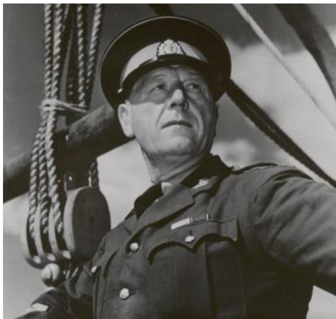
Captain Henry Larsen - on arrival of MV St Roch, Vancouver, B.C. October 16 1944.