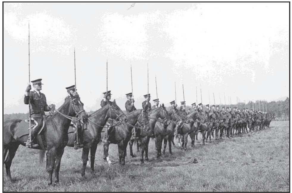
Exercise ride in Windsor Great Park

The Sunday morning before the start of the show, we had a church parade followed by a reception at Windsor's Guildhall, attended by many distinguished guests and notable people including the ex-Governor-General of Canada, Field Marshal Earl Alexander of Tunis. That afternoon we rode to Windsor Great Park and paraded, still in review order, to the opening day of the polo season, with the Queen in attendance and in the evening, we were entertained by the Master of the Hounds at a champagne cocktail party and "a good time was had by all!" The next day we were given a tour of Windsor Castle and saw seventeen rooms in the royal apartments that are not open to the public.