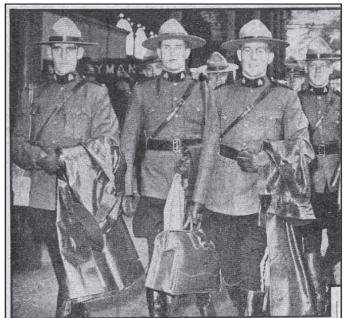
THE “MOUNTIES” IN LONDON. Men of the musical ride of the Royal Canadian Mounted Police arriving at Euston Station yesterday from Liverpool, where they landed from the liner Saxonía . They will appear at the Royal Windsor Horse Show and at agricultural and horse shows during the summer. The ride consists of a full troop of 32 men and horses.