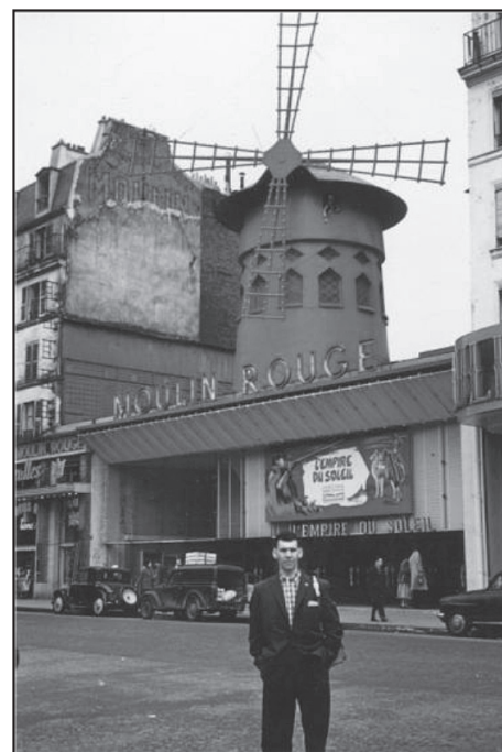
Easter weekend in Paris.

On Easter weekend, three of us were granted permission for a weekend pass and we flew to Paris to see the sights. We managed to see all the highlights; the Eiffel Tower, the Louvre, Napoleon's Tomb, Notre Dame Cathedral, Arch of Triumph, the Moulin Rouge in Rue Pigalle and Sacre Coeur in Montmartre and enjoyed several restaurants and bars. Sunday evening we got back to Windsor after our whirlwind trip and that weekend was definitely one of the biggest thrills of our trip overseas.