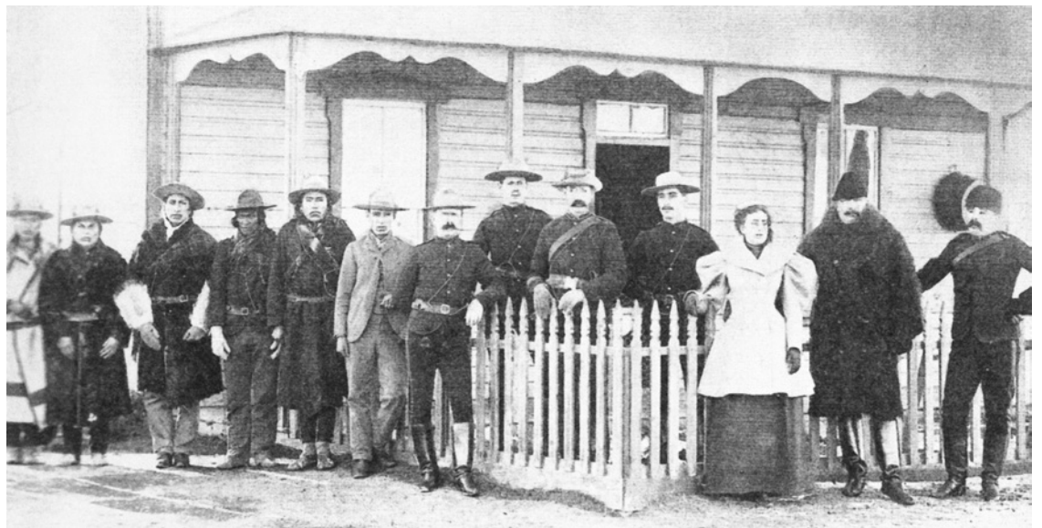
NWMP Detachment, Standoff, 1884. Superintendent Steele (in buffalo coat), Inspector Jarvis, personnel and Indian scouts.