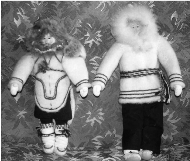
Eskimo dolls circa 1950