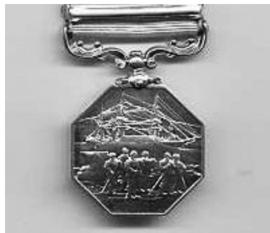
Reverse of medal and ribbon

The second presentation of the Arctic Medal was to the crews of three ships exploring the Arctic in 1875-76.