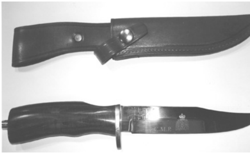
Hunting knife and sheath. Knife blade bears the inscription of the R.C.M.P., the crest of the Force, and the Royal Appointment legend of British Ceremonial Imports Ltd., as official manufacturer.